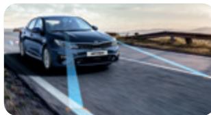
Lane Following Assist (LFA) & Lane Keeping Assist (LKA)

Using camera and radar, SCC maintains your set speed, ensuring a safe distance between you and the vehicle ahead. To keep a set safe distance, the system will apply the brakes, and even stop the car, until the vehicle ahead proceeds.