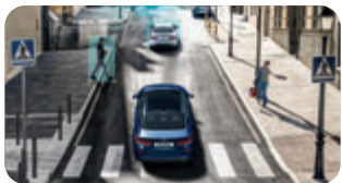
Forward Collision-Avoidance Assist (FCA)

Evaluating both camera and radar data from your vehicle, the FCA system detects both preceding vehicles and pedestrians crossing the road and warns the driver in the event of any potential collision risk.