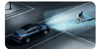
Dynamic Low Beam Assist

You'll have no nasty surprises when backing out of a parking space or driveway. RCCA gives audio/visual warnings and assists with braking if the rear corner radar detects any crossing traffic.