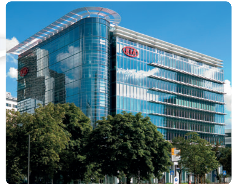
Kia European Headquarters and Design Centre Europe in Frankfurt/Main, Germany