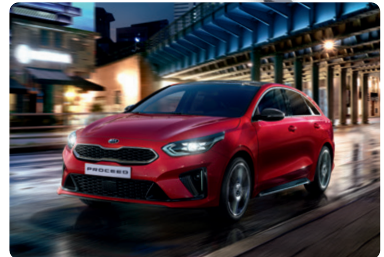
European design, European engineering, built in Europe: The Kia ProCeed

Žilina, Slovakia, is the home of Kia's European manufacturing facility. It produces up to 300,000 vehicles each year, and its impressively high quality standards achieved ISO14001 certification in 2011. The plant produces the majority of Kia vehicles sold in Europe.