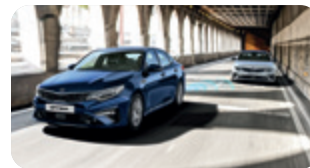
Blind-Spot Collision-Avoidance Assist (BCA)

This system uses camera sensors to monitor road markings and check whether your car is in the centre of your lane. It warns you when the vehicle is approaching the lane boundaries and if necessary adjusts the steering.