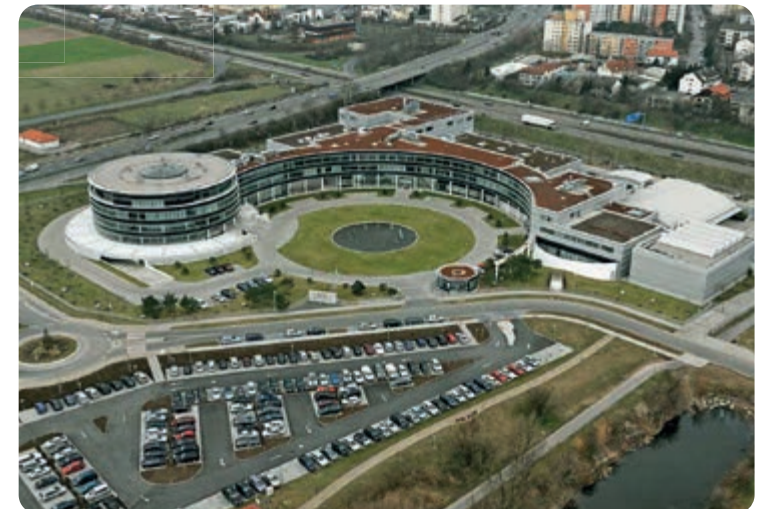
Kia R&D Centre Europe in Rüsselsheim, Germany