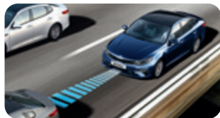
Smart Cruise Control (SCC) with Stop & Go

Evaluating both camera and radar data from your vehicle, the FCA system detects both preceding vehicles and pedestrians crossing the road and warns the driver in the event of any potential collision risk.