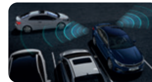
Rear Cross Traffic Collision-Avoidance Assist (RCCA)

BCA detects any vehicle(s) in your blind spot and alerts you with a warning symbol in your side mirror and on the centre display inside the car together with an audible alert. It will also automatically apply the brakes to avoid a collision.